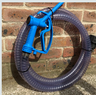
Nozzle and hose equipment