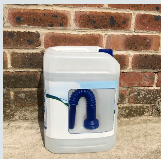
Adblue 10 litres-5000 litres

Did you know that we supply a wide range of tanks and dispensing equipment across the UK to keep your fuels safe and to prevent spills or leaks?