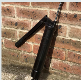
Grease guns and cartridges