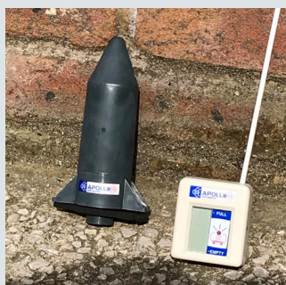
Fuel monitoring equipment