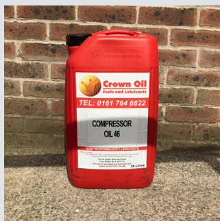
Oils and lubricants