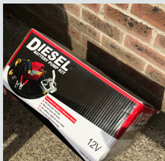
Battery pumps and kits