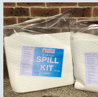
20L Spill kits