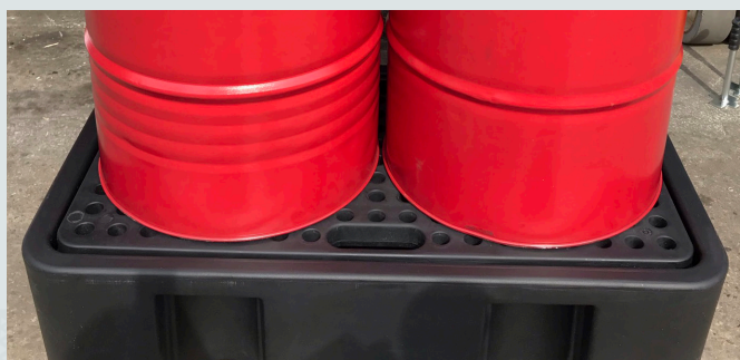
Drip trays and safety equipment